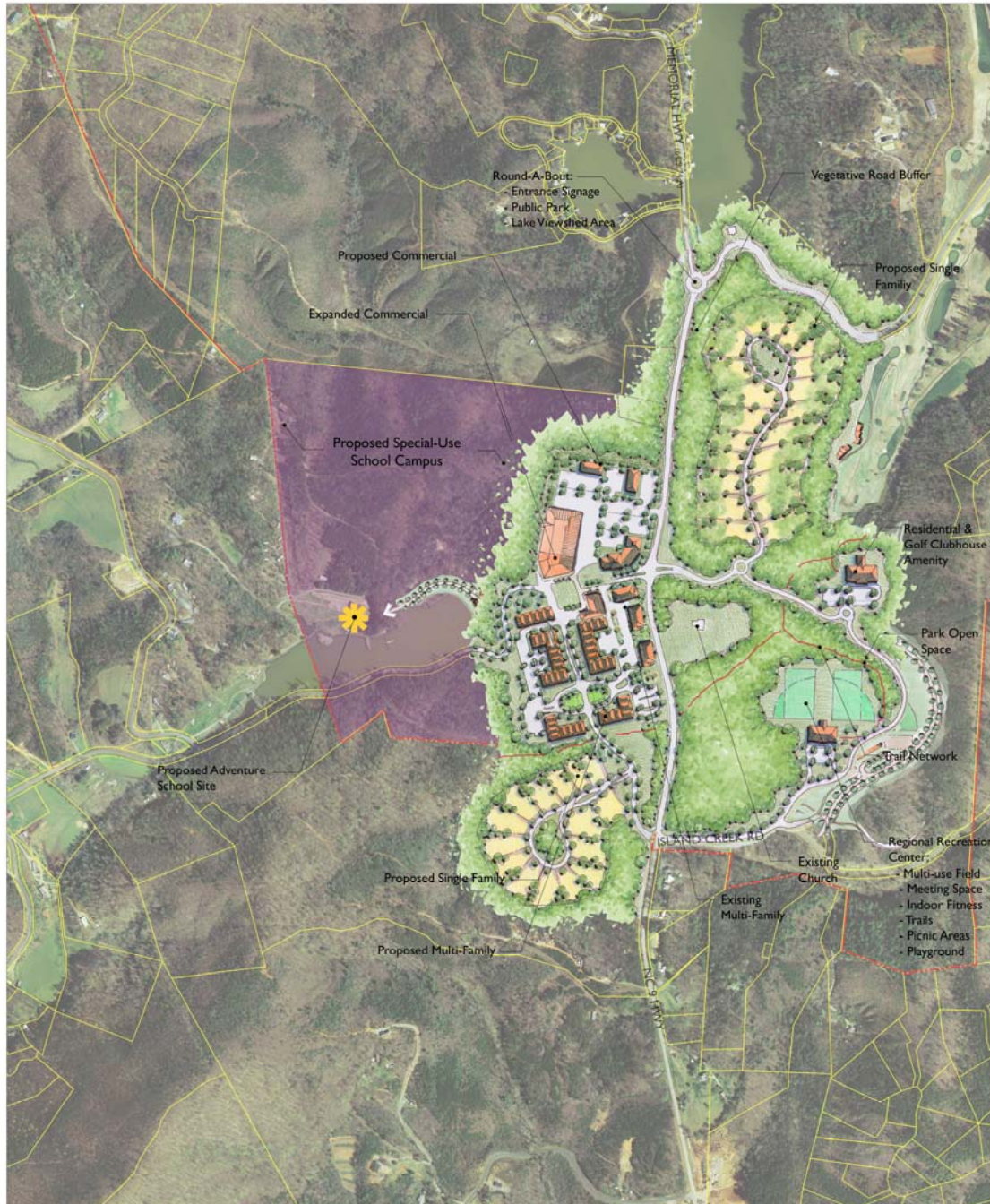
Figure 14 - Mixed-Use Node

This is only a design study. It is one of 100 or more ways to interpret the policies in the plan, and shows how such policies might be manifested in future development / redevelopment.