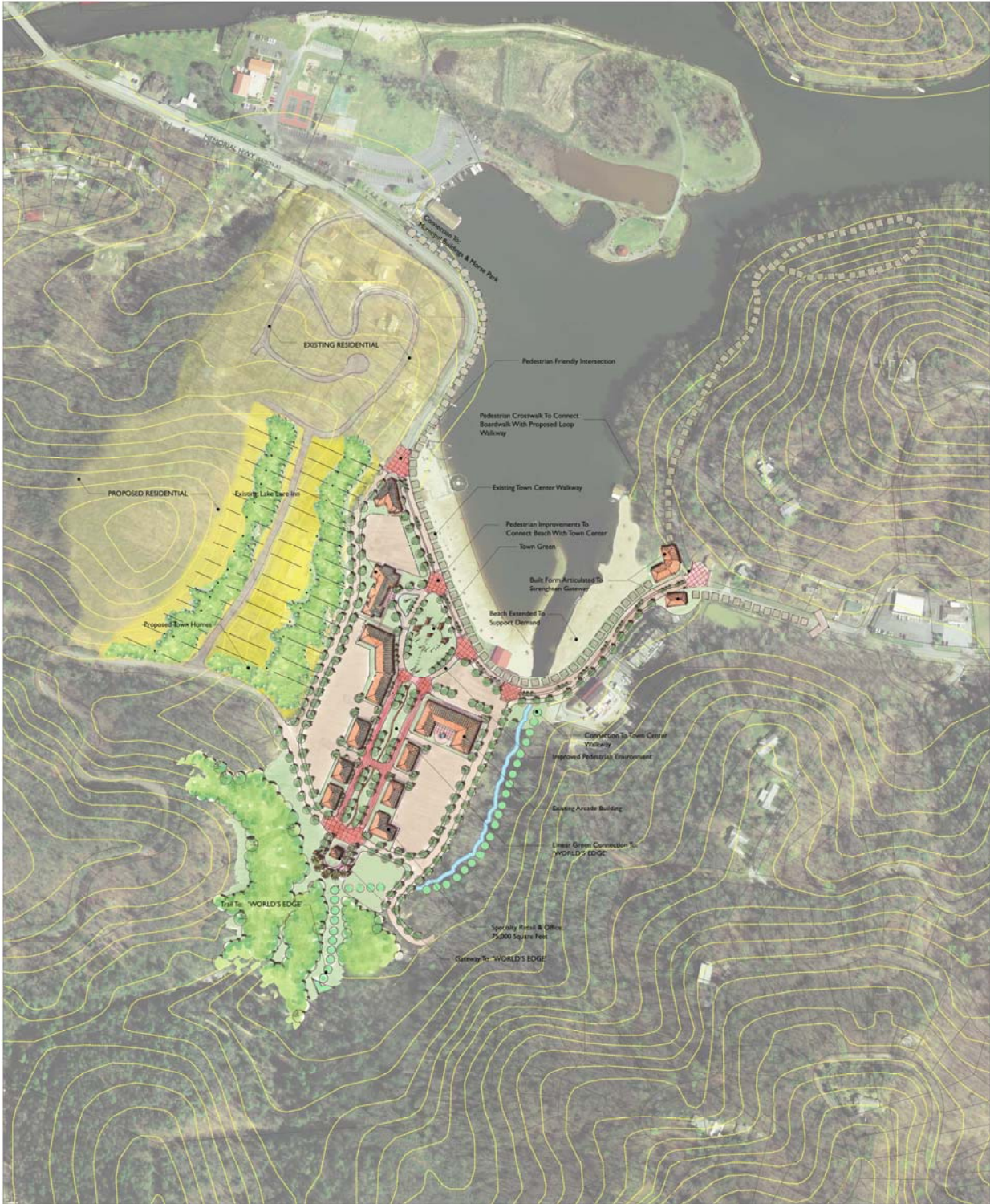
Figure 13 - Town Center

This is only a design study. It is one of 100 or more ways to interpret the policies in the plan, and shows how such policies might be manifested in future development / redevelopment.